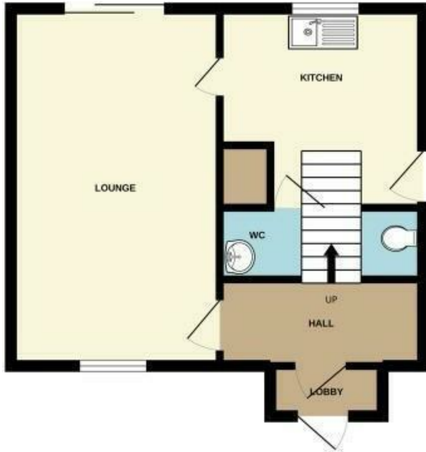
GROUND FLOOR 377 sq.ft. (35.0 sq.m.) approx.