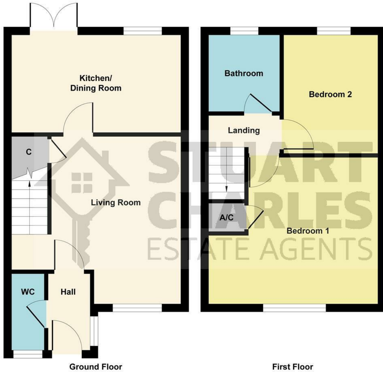
Illustration for identification purposes only, measurements are approximate, not to scale. Produced by Elements Property