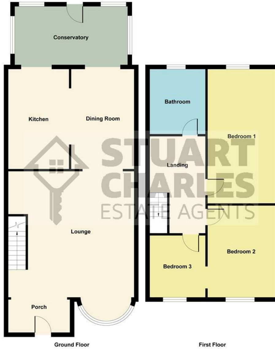
Illustration for identification purposes only, measurements are approximate, not to scale. Produced by Elements Property